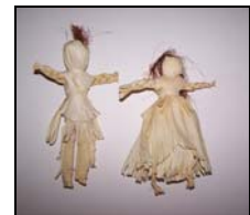
Corn husk dolls

Survival Skills – Historic & Modern – Doyle Blooding. Doyle is an Army veteran with years of survival training from the western mountains to Alaska. Students will learn a multitude of historical living skills and how they compare with modern methods and then make their own basic fire starting kit including learning how to make char cloth. Doyle will