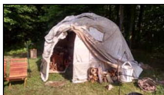
Lenni Lenape wigwam