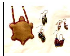
Beaded turtle & earrings