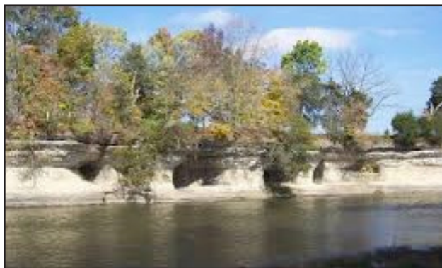
6th Annual Days at the Pillars August 24 and 25, 2019: 10:00 am - 4:00 pm Property at 7 Pillars, Miami County, IN

*One day additional classes TBA throughout the year.