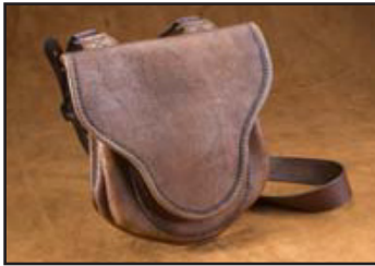
Leather Hunting Bag