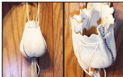
Leather Tulip Bag