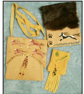
Painted Leather Pouches