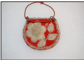
Raised Iroquois Beadwork (antique beadwork)