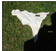
Brain Tanned Deer Skin