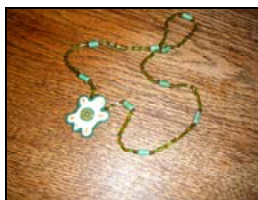
Beaded Turtle Pendant