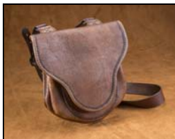
Leather Hunting Bag