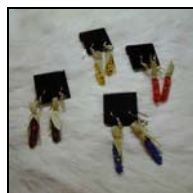
Beaded Indian Corn Earrings Sample – Katrina Mitten