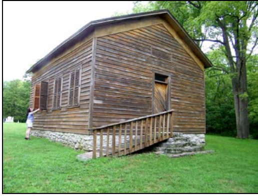
Miami Schoolhouse near Peru ~ Culture Class Field Trip