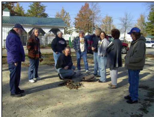
Starting the fire at the 2007 Fall Friendship Fire

The registration fee of $25 for current NCGLNAC members and $30 for non-members includes all activities and presentations and the Saturday evening meal. Please send your registration to be received by October 25 . See the Fall Friendship Fire flyer on page 7 of this newsletter for complete details.