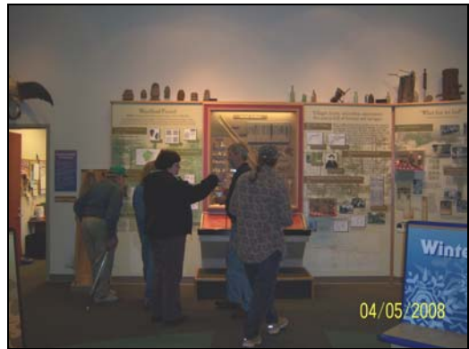
2008 Spring Cultural Arts Classes Field Trip to Anderson Mounds

historical nature. The complete flyer for the 2009 Spring Cultural Arts Classes will be included as part of the NCGLNAC January 2009 Newsletter.