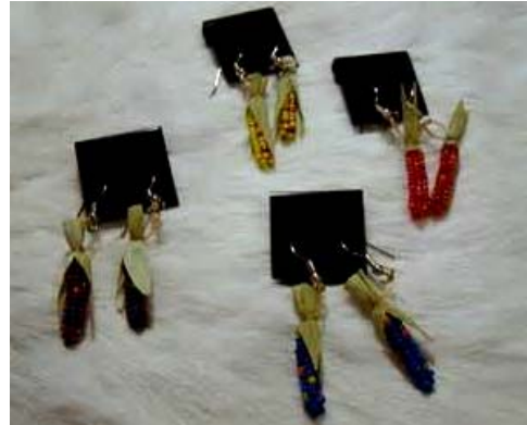
Beaded Indian Corn Earrings sample – Katrina Mitten