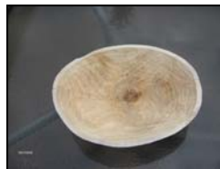
Hand-Carved Wood Ceremonial Bowl