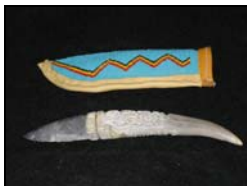
Antler-handled Flint Knife