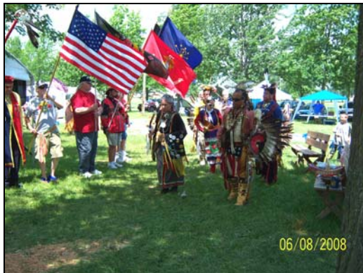
Grand Entry 2008 Gathering, June 8

An event of this size is not possible without the help of many volunteers who give unselfishly of their time and talents, and the sponsors and advertisers whose donations make paying the bills possible. The NCGLNAC Gathering of Great Lakes Nations is always held on the weekend before Father's Day weekend. Mark your calendars for upcoming Gatherings: June 13 and 14, 2009 and June 12 and 13, 2010.