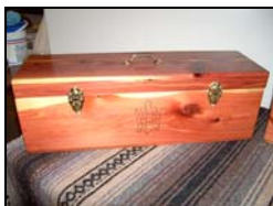
Large Cedar Box