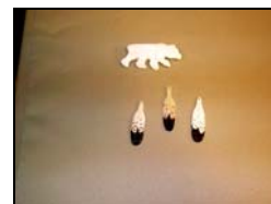
Carved Bone Earrings and Broach