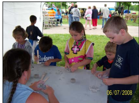
Children working on their clay pots – 2008 Gathering