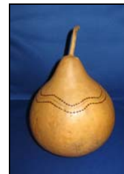
Children’s Gourd Container