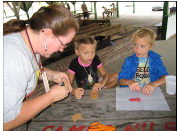
Children learning beading in 2006 children’s class

So please join us August 6 – 10 for a wonderful week of learning about Great Lakes Native American cultural arts. Bring the family!