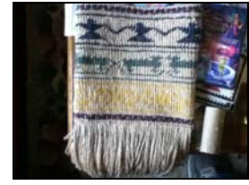
Tina Burns – Twined Woven Bag