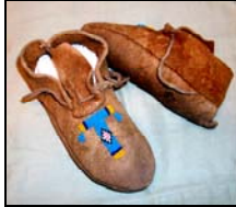
Paula Butcher – Side Seam Moccasins