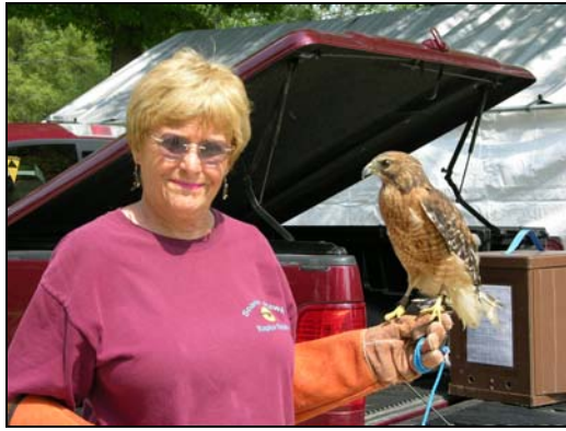
Broad Winged Hawk with handler