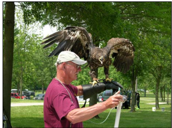
Immature Bald Eagle with Soarin'Hawk handler