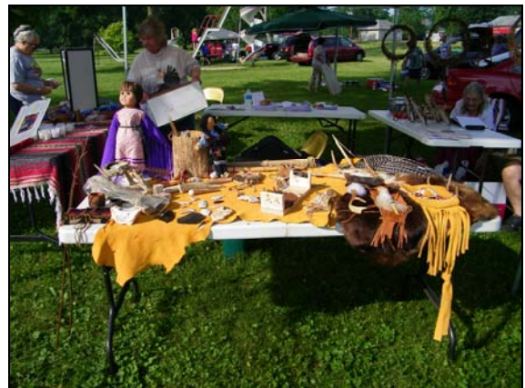
NCGLNAC booth at Albany Cruise-In