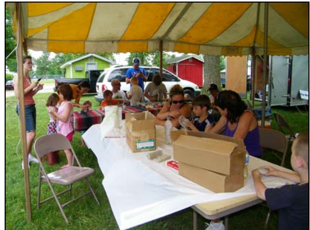
Children's Activities – 8 th Annual NCGLNAC Gathering

Mark your calendars for 2012 for the 9 th Annual Gathering of Great Lakes Nations, June 9 and 10.