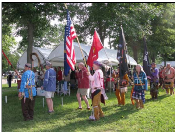
8 th Annual NCGLNAC Gathering Grand Entry