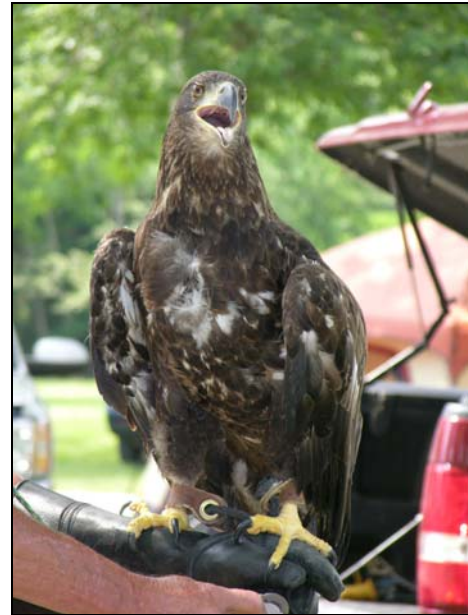
Immature bald eagle at 2013 Gathering Soarin' Hawk presentation