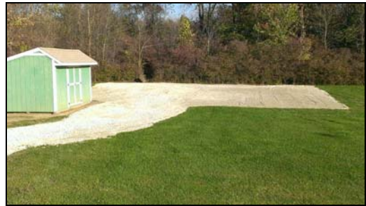
Finished parking lot and drive from Morton Street

and any other trail improvements. The trail has four areas that need bridging improvements and NCGLNAC will proceed with those as funds allow.