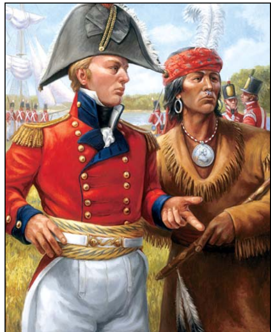
British General Sir Isaac Brock and Tecumseh

The Academic Conference registration brochure is included as an insert for this Newsletter.