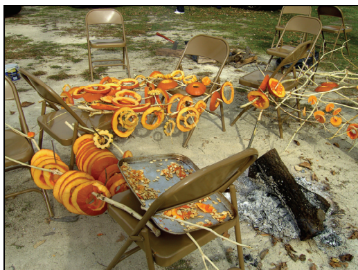
Pumpkin rings drying by the fire at 2010 Fall Friendship Fire