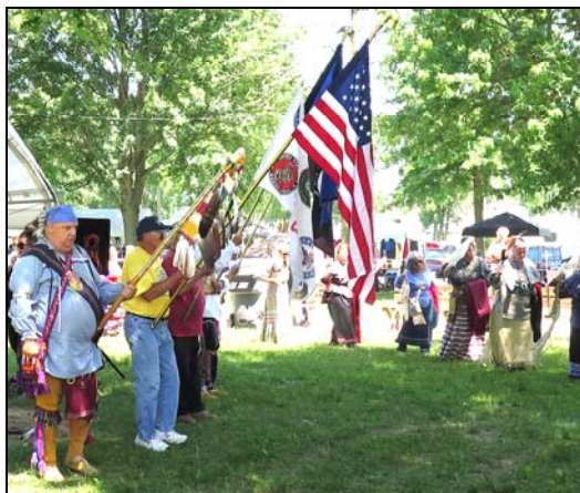
2016 Gathering Grand Entry

Plans are underway by the Gathering Committee for next year's 14 th Annual Gathering June 10 and 11. Some special events are planned so mark your calendars and plan to attend.