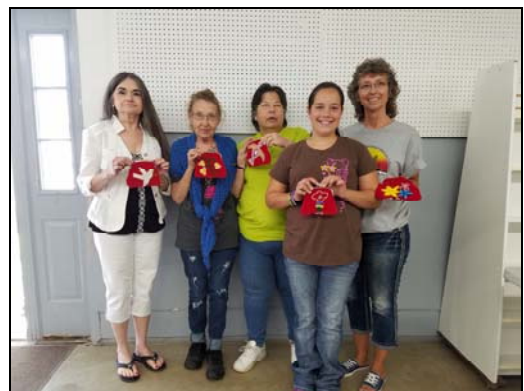
Iroquois beading class