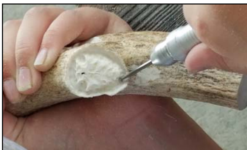
Antler Carving Class