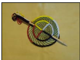
Sweet Grass Weaving