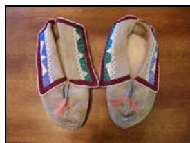
Center Seam Moccasins