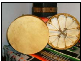
Hand Drum Class