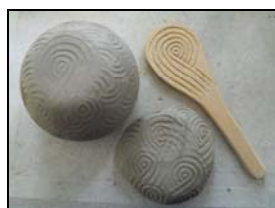
Paddle Stamped Pottery and Paddle