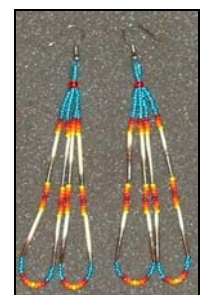
Beaded and Quilled Earrings