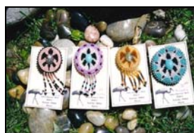
Beaded Turtle Pins