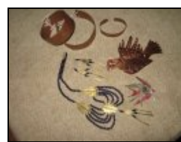
Copper Work in Children's Class