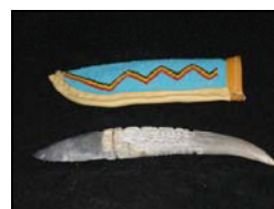
Antler Handled Flint Knife