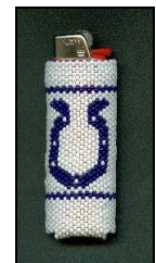
Peyote Beaded Lighter Case