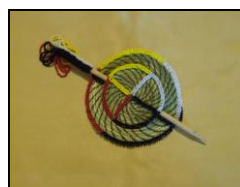
Sweet Grass Hair Piece