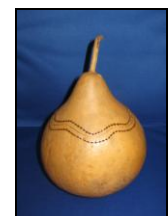
Children’s Class Gourd Container