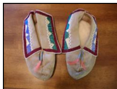
Center Seam Moccasins