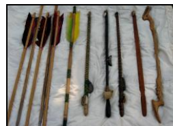
Atlatl and darts