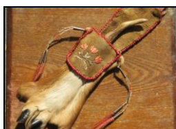
Deer Leg Knife Sheath