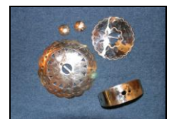
18 th Century Trade Silver