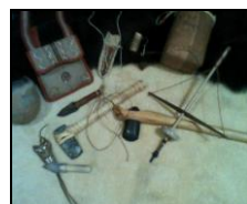
Primitive technology/Bow drill