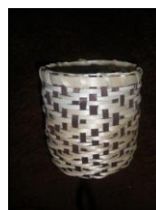
Black Ash Basket