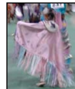
Dance Shawl – Wednesday Children’s Class