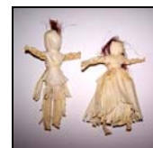
Corn Husk Dolls – Friday Children’s Class