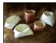
Mukuks – Tuesday Children’s Class